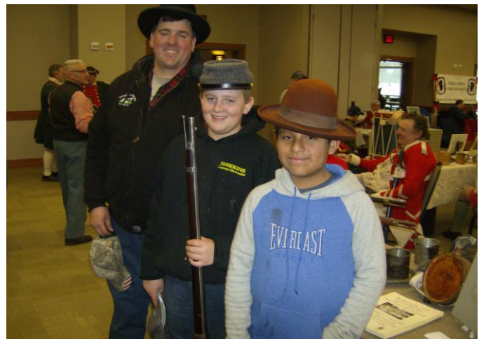
(Possible New Recruits)